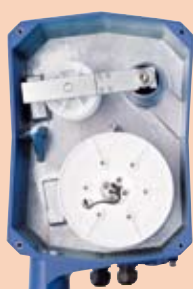
View electronic chamber