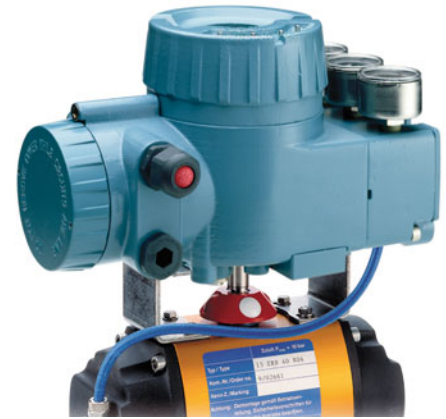
Example for mounting on rotary actuators.